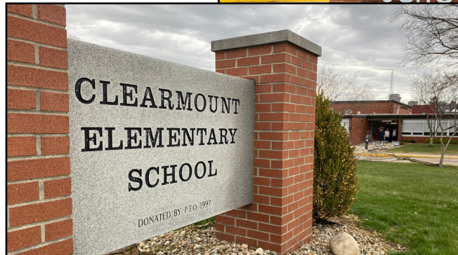
Bottom: Clearmount School built in 1959.