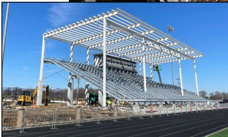
Bottom: Trackside view of the new Grandstands still under construction.