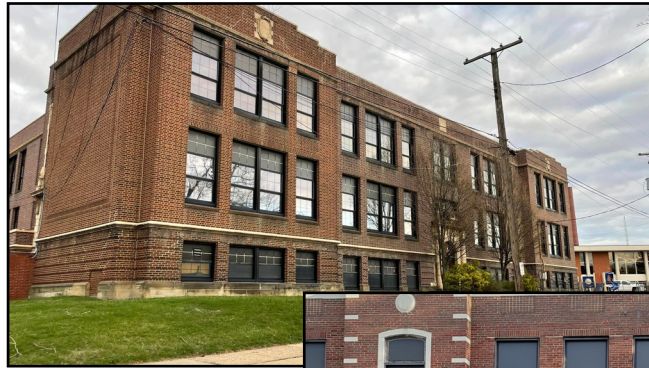
Top: Portage School completed in 1924.

All three schools will be vacated at the end of the school year. Additional photos of all three open houses are located on pages 2-4 of this issue.