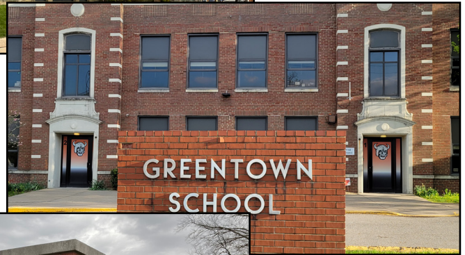
Below: Greentown School built in 1928.