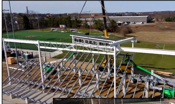
Top: The new pressbox being lifted into place on the new Grandstands.

Our mild winter and early spring weather helped work crews and their construction progress of our new West Grandstand. Everything is right on schedule for the new improved stands' premier event, our opening football game on August 18th against Akron Buchtel.