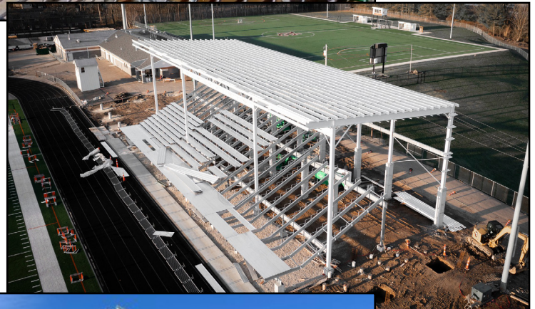
Right: Ariel view of the stands.