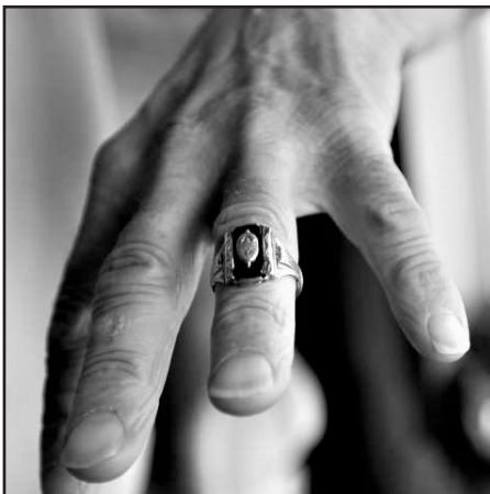
The ring isn't too bad looking after being buried for 53 years!

Once cleaned, the ring looked new, except for a small bend in it. As new as the day he once gave it to a high school girlfriend to signify they were going steady. As new as the day he got it back after they'd broken up. As new as the day he'd lost it 53 years ago.